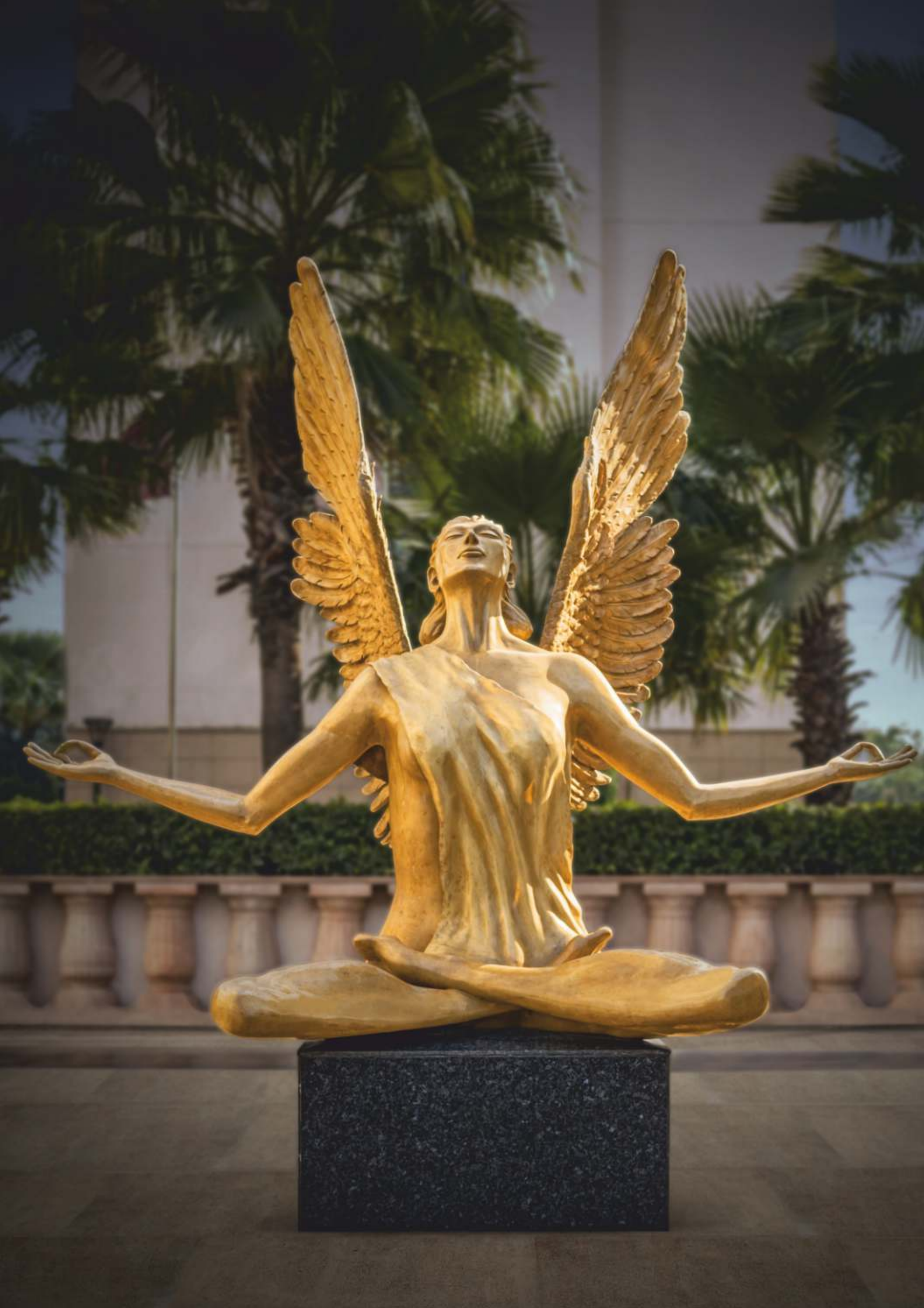
ACTUAL IMAGE OF THE HIBISCUS, GURUGRAM