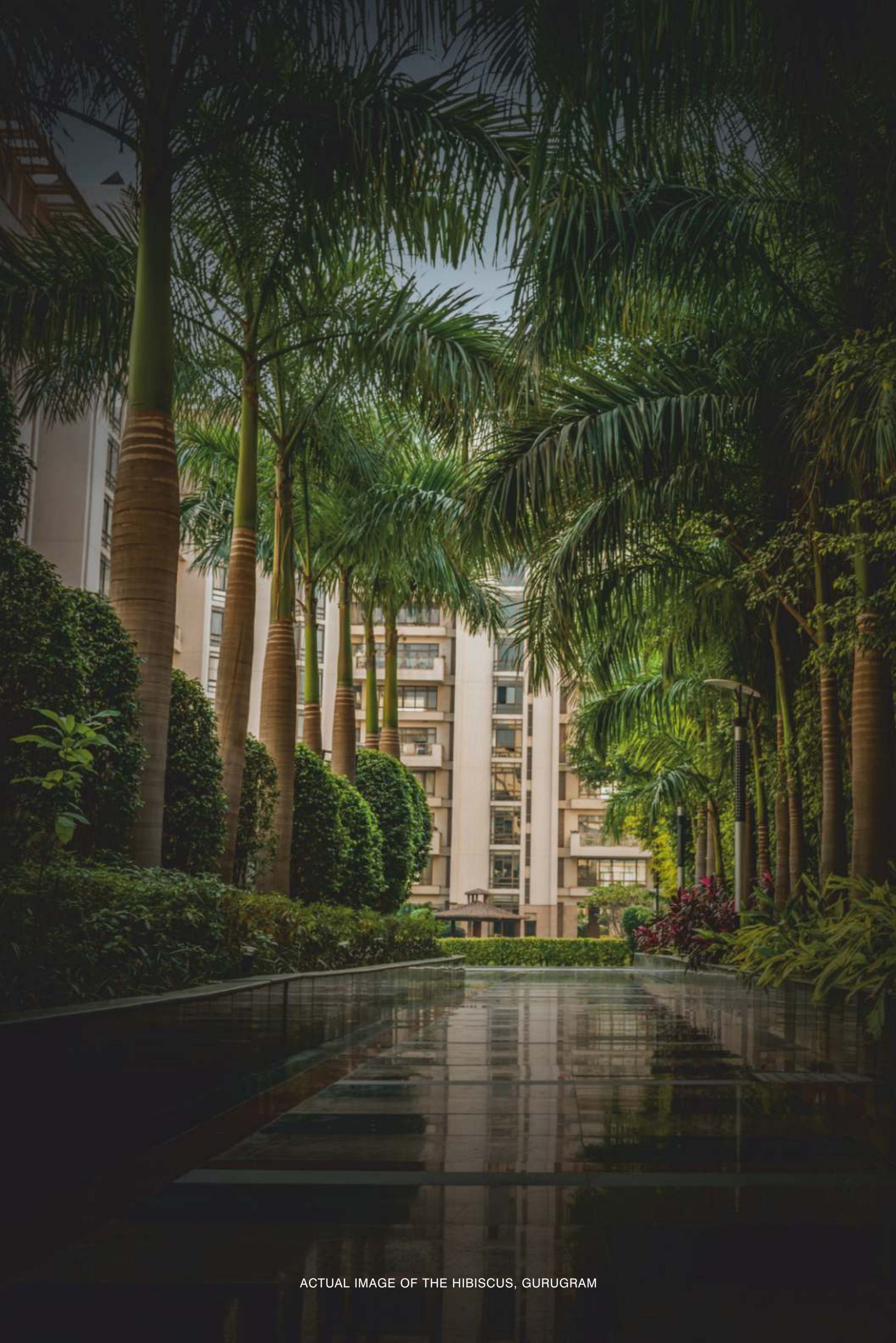
ACTUAL IMAGE OF THE HIBISCUS, GURUGRAM