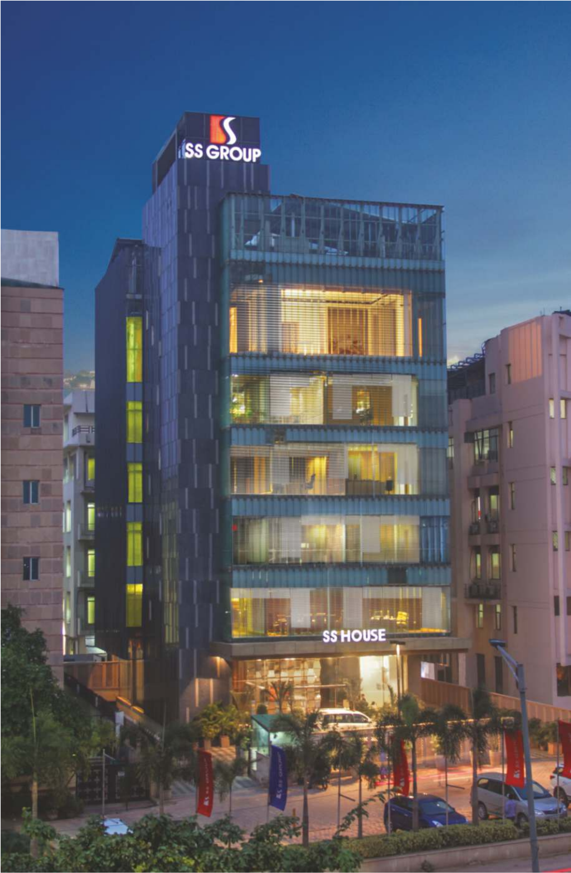
ACTUAL IMAGE SS GROUP CORPORATE OFFICE