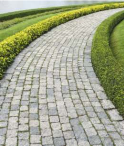
DELIGHT AND SPLENDOURS