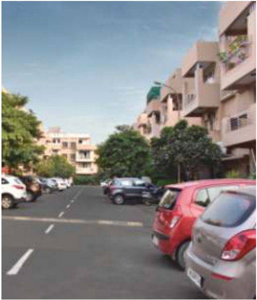
THE LILAC (I & II)